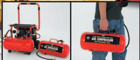
Features a detachable portable tank with built in hose